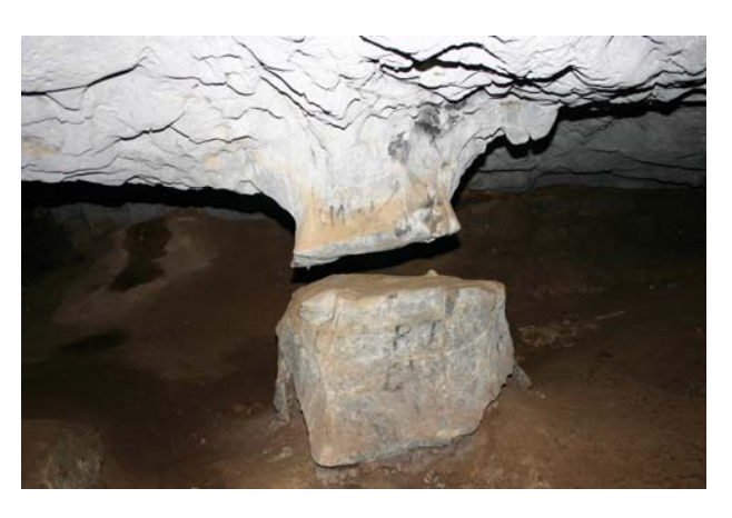
A 'broken column' in Main Cave.