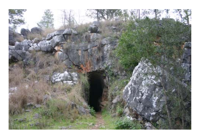
Above : The modified main entrance to Main Cave. Below : Interpretive signage near the car park.