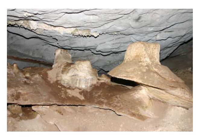
A remnant false floor and speleothems - Main Cave.