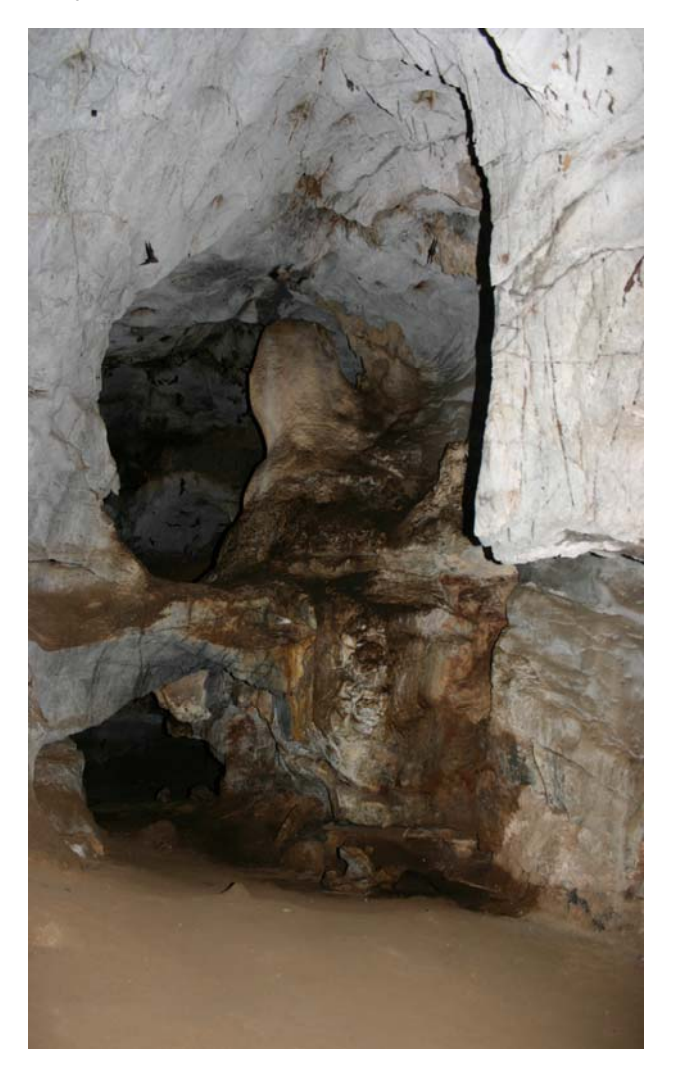
A view from the Main Cave central passageway through to the main 'bat chamber' to the right.

Of course, the likes of 'us' will readily find a hour or two of pleasure and interest in wandering through the Ashford Caves – as I did. I certainly recommend it if you are in the area.