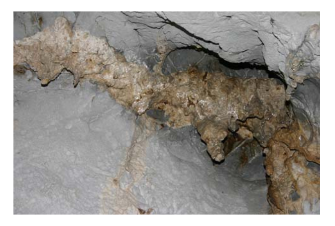
Speleothems on the ceiling of Main Cave – few are extant in the cave.